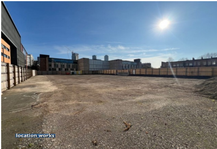
Unit base, approx. 19,000 sq ft of private, gated production parking. Central London.